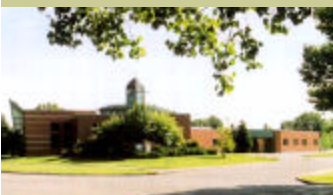
St. Bonaventure's Parish

In a Christian community, there is dialogue and true reconciliation as they see each other as equals. One does not project one's